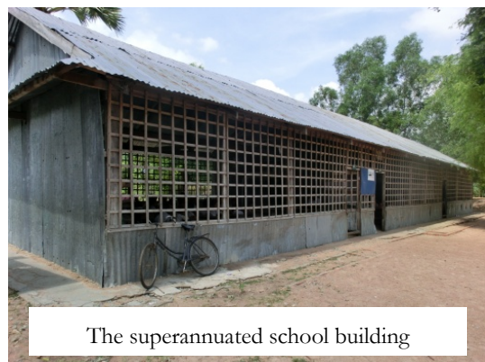
The superannuated school building

This project is to construct a 5-room concrete school building equipped with school furniture and sanitation facilities at Chaong Maong Primary School in Teuk Phos District, Kampong Chhnang Province. With this project, 252 students will be able to enjoy studying in the improved educational environment.