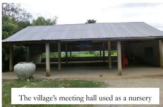
The village's meeting hall used as a nursery