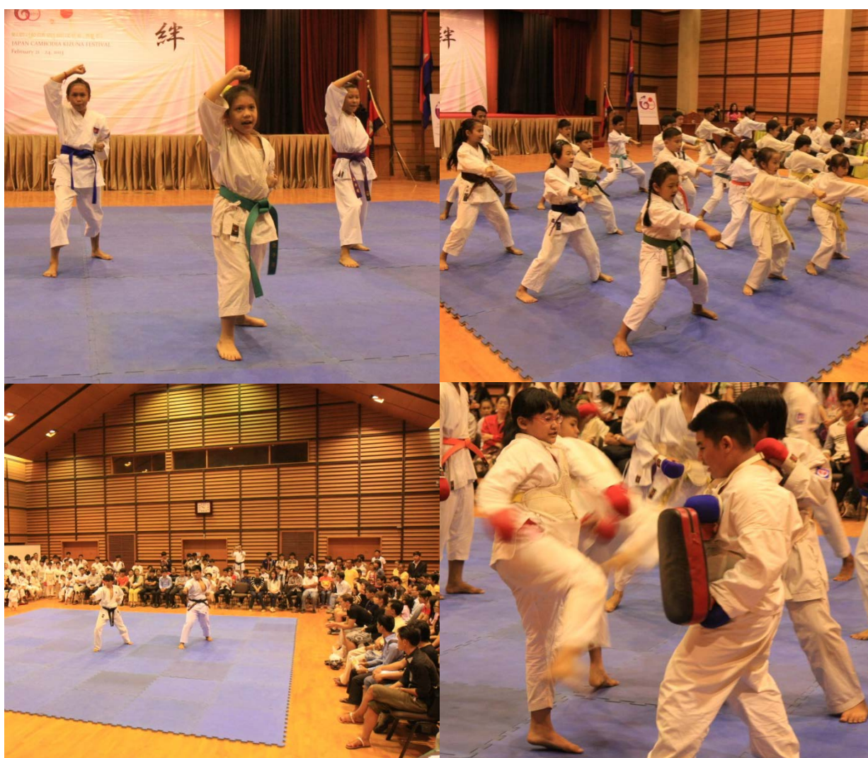
Karate demonstration after the signing ceremony

Embassy of Japan in the Kingdom of Cambodia