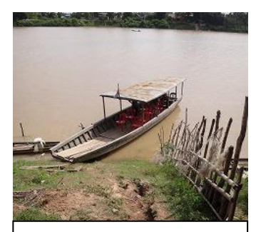
Natural landing (Preah Vihear Province)

Recipient: Kampong Sralau Muoi Commune Council, Chhaep District, Preah Vihear Province