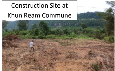
Construction Site at Khun Ream Commune

In order for local residents in Khun Ream commune in Banteay Srey district to have a better access to medical care, Plan International Cambodia will construct a health center