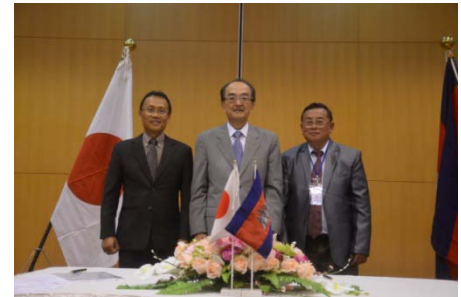
Cheung Prey Hospital