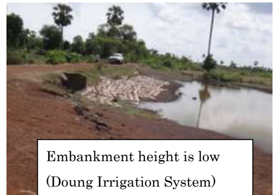
Embankment height is low (Doung Irrigation System)

This project is to rehabilitate 750 m of embankment, an intake structure and an outlet structure, and to construct an intake structure and two outlet structures. It is expected to reduce the annual flood damage and provide better access to irrigation water for around 750 households in the region.