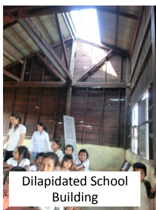
Dilapidated School Building