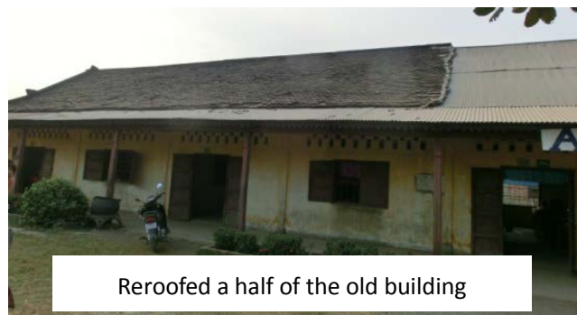
Reroofed a half of the old building

This project is to construct two school buildings at Phnom Thom lower secondary school in Mongkol Borey District, Banteay Meanchey Province. With this project, over 670 school children will be able to study at the safe and comfortable classrooms.