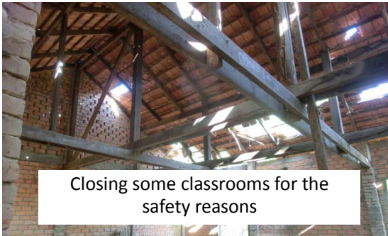
Closing some classrooms for the safety reasons