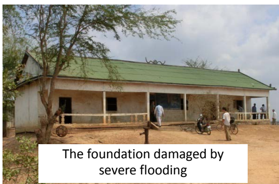
The foundation damaged by severe flooding

Recipient: Kampong Trabaek District Office of Education, Youth and Sport in Prey Veng Province