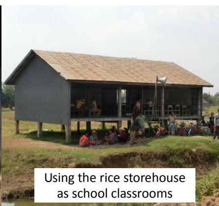
Using the rice storehouse as school classrooms

Recipient: Samaritan's Purse International Relief