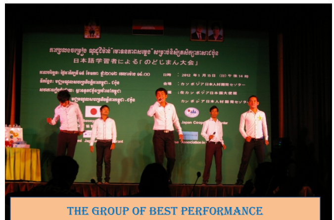
THE GROUP OF BEST PERFORMANCE

Participating in a Japanese speech contest is often viewed as a difficult task by Japanese language beginners. However, participating and even winning a Japanese singing contest is a more easier and enjoyable task. For this very reason, the NODOJIMAN Contest has been served as a means to encourage Japanese language students of all levels to practice vocalization of the language. In addition, by singing Japanese songs, it is expected that understanding of Japanese culture and Japanese language among Cambodian people will be further promoted through the Japanese song contest.