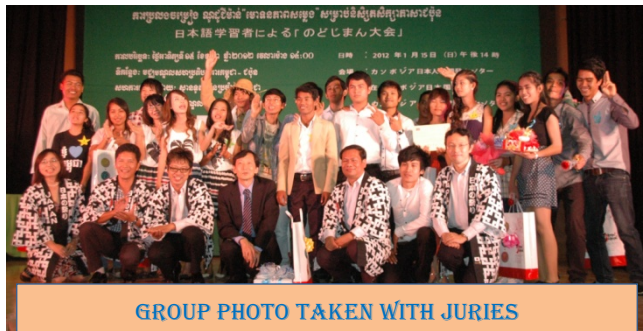
GROUP PHOTO TAKEN WITH JURIES

The Embassy of Japan in collaboration with the Cambodia-Japan Cooperation Center (CJCC), under support from Origami School and Japanese Association in Cambodia, has organized the Nodojiman “Japanese Song Contest” for the Japanese learning Cambodians.