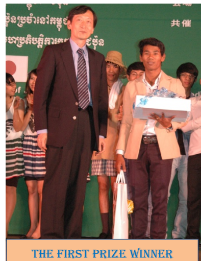
THE FIRST PRIZE WINNER