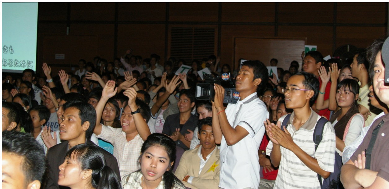
THE CONTEST PARTICIPANTS

Participating in a Japanese speech contest is often viewed as a difficult task by Japanese language beginners. However, participating and even winning a Japanese singing contest is a more easier and enjoyable task. For this very reason, the NODOJIMAN Contest has been served as a means to encourage Japanese language students of all levels to practice vocalization of the language. In addition, by singing Japanese songs, it is expected that understanding of Japanese culture and Japanese language among Cambodian people will be further promoted through the Japanese song contest.