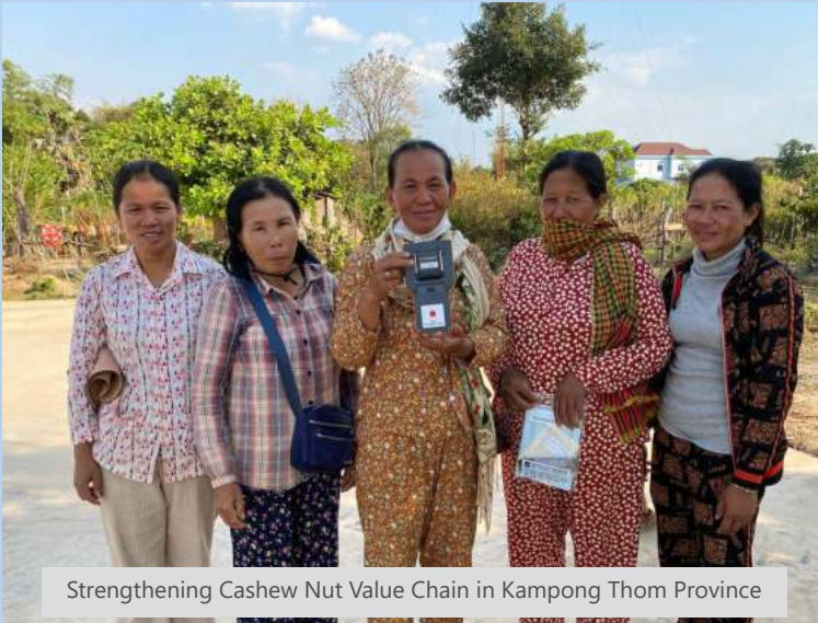
Strengthening Cashew Nut Value Chain in Kampong Thom Province