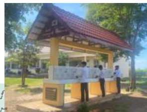
Constructing Hand Washing Stations in 6 Schools at Western Part of Stung Treng Province (2021)