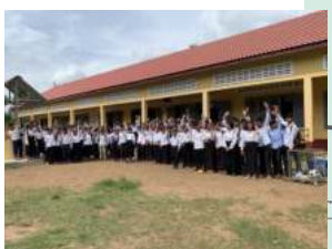
Constructing School Building at Khyung Lower Secondary School in Chey Saen District, Preah Vihear Province (2021)