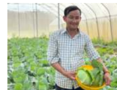
Leader, Agricultural cooperative

"Since the completion of the project, our association has been collecting agricultural products and distributing them to the market every day. It has been contributing to better livelihoods. Thank you for the support of the KUSANONE grant."