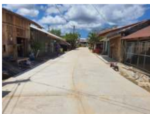
Road Improvement in Andong Teuk Commune, Botum Sakor District, Koh Kong Province (2020)