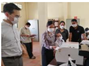
Installing Braille Equipment at Special Schools in Phnom Penh, Siem Reap, Battambang, and Kampong Cham (2020)