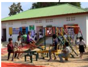
Constructing Eight Pre-School Facilities in Kampot Province (2019)