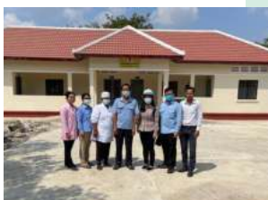
Constructing Maternity Ward at Kampong Lapov Health Center in Battambang Province (2020)