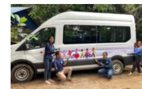
Safe Haven (NGO)

"Being able to frequently follow-up children with disabilities is very important. Thanks to the KUSANONE grant for providing a mobile clinic van, we can now load more medical equipment and staff and see clients who live in the same area at once regardless of rain."