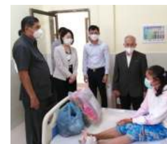
Director, Provincial Health Department

"This building really helps to promote health care delivery in terms of equitable services and quality of care in a remote area of Preah Vihear province."