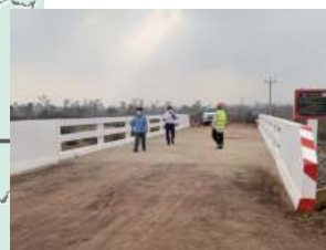
Constructing Bridges in Kseum Commune, Snuol District, Kratie Province (2020)