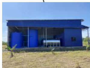
Installing Small Pipe Water Supply System at Kaoh Peam Reang in Prey Veng Province (2021)