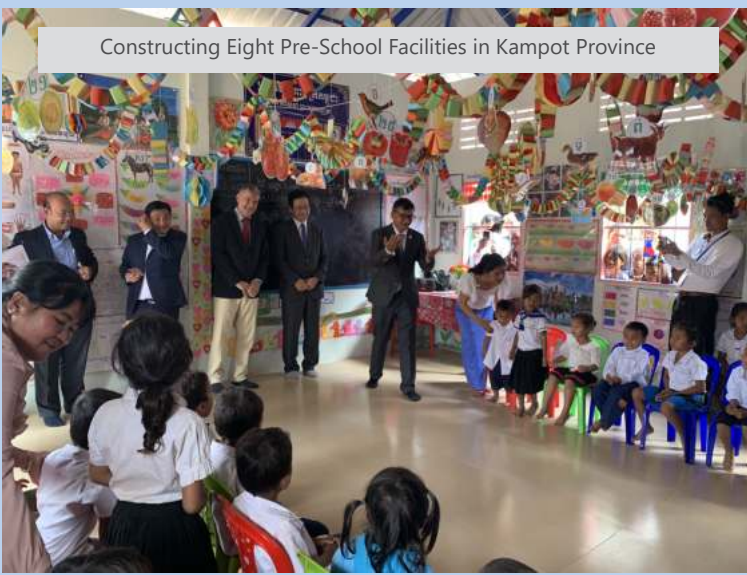
Constructing Eight Pre-School Facilities in Kampot Province

Japan's Grant Assistance for Grass-Roots Human Security Projects