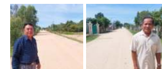
Two commune chiefs

"Thanks to the KUSANONE project for improving the road for people in Bos Morn and Pong Teuk communes, which facilitates travel in both dry and rainy seasons and saves a lot of time for students, workers, and farmers in their travels."