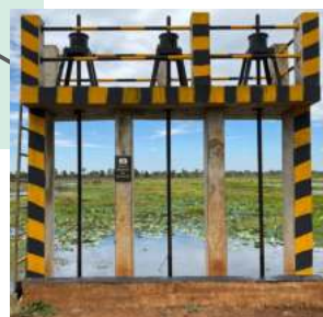
Rehabilitating Kosh Svay Irrigation in Kampong Cham Province (2020)