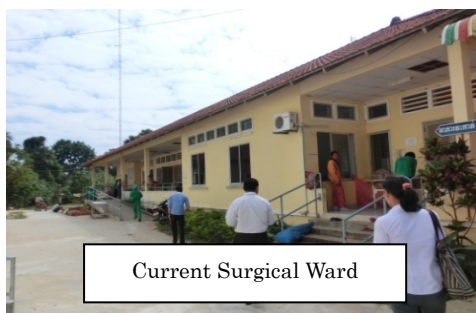
Current Surgical Ward

1- The Project for Renovating Surgical Ward in Pea Raing Referral Hospital in Prey Veng Province (US$109,214) Recipient: Pea Raing Operational District Prey Veng Province With the purpose of strengthening capacity of medical services, Pea Raing Operational District in Prey Veng Province will renovate a surgical ward and install latest surgical equipment at Pea Raing Referral Hospital.