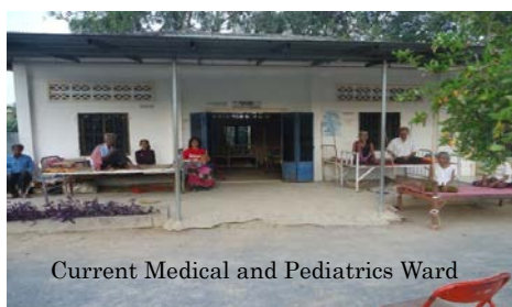
Current Medical and Pediatrics Ward

3- The Project for Constructing Medical and Pediatrics Ward at Prey Kabas Referral Hospital in Takeo Province (US$116,120) Recipient: Prey Kabas Operational District Takeo Province