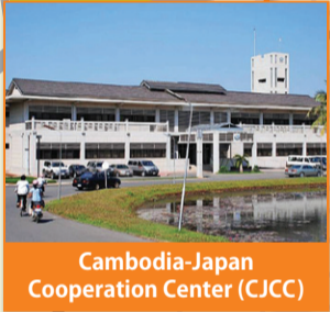
Cambodia-Japan Cooperation Center (CJCC)