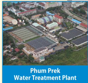
Phum Prek Water Treatment Plant