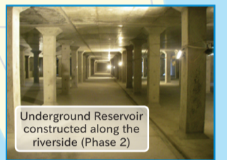
Underground Reservoir constructed along the riverside (Phase 2)