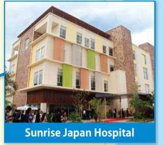
Sunrise Japan Hospital