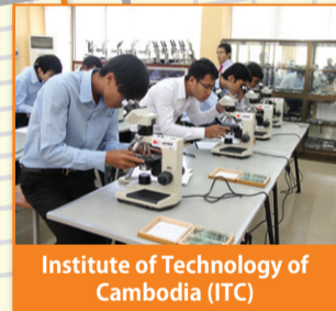
Institute of Technology of Cambodia (ITC)