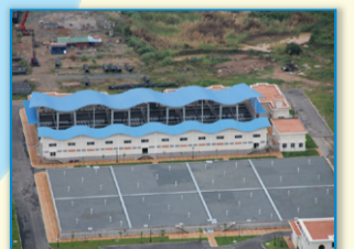
Niroth Water Treatment Facilities