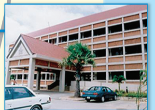
National Tuberculosis Center