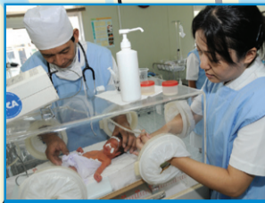
National Maternal and Child Health Center