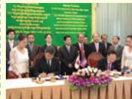
Siem Reap Water Supply Expansion Project (YL: ¥7,161mil. '12)