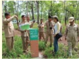
Project for Facilitating the Implementation of REDD+ Strategy and Policy (TC: '11-)