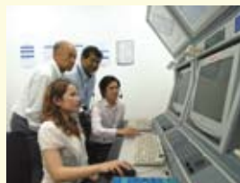
Project for the Capacity Development for Transition to the New CNS/ATM Systems in Cambodia, Lao PDR and Vietnam (TC: '11-)