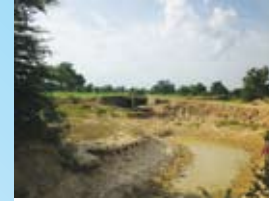
West Tonle Sap Irrigation and Drainage Rehabilitation and Improvement Project (YL: ¥4,269mil. '11-)