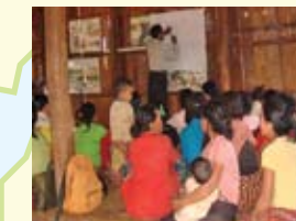
Capacity Development of Provincial Rural Development in Northeastern Provinces (TC: '07-'11)