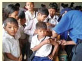
The Project for Infectious Disease Control (I-III) (GA: ¥905mil. '03, '05, '08)