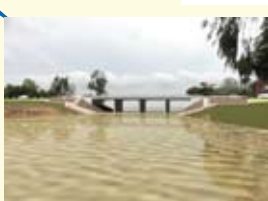
Project for Flood Disaster Rehabilitation and Mitigation (GA: ¥1,510mil. '12)

Notes : (GA) : Grant Aid (TC) : Technical Cooperation Project (YL) : Yen Loan (CPF) : Counterpart Fund (Number) : Completed Year for (CPF) : Settled Year for (YL) (GA) : Implementation period (TC)