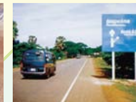
The Project for Improvement of National Road No.7 (Kampong Cham Section) (GA: ¥1,975mil. '01) The Project for Rehabilitation of National Roads No.6, 7 (GA: ¥4,578mil. '97)