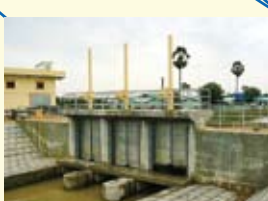
The Project for the Rehabilitation of the Kandal Stung Irrigation System (GA: ¥1,784mil. '05) (CPF: '09)