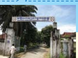
The Project for Improvement of Medical Equipment in National, Municipal and Provincial Referral Hospitals (GA: ¥374mil. '12)