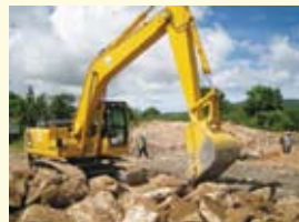
The Programme for Improvement of Capabilities to Cope with Natural Disasters Caused by Climate Change (GA: ¥1,000mil. '10)