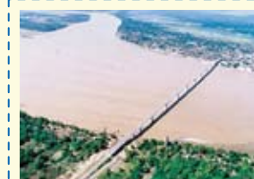
The Project for Construction of a Bridge over the Mekong River (Kizuna Bridge) (GA: ¥6,607mil. '97)