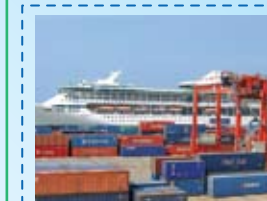
Sihanoukville Port Urgent Rehabilitation Project (YL: ¥4,142mil. '99) Sihanoukville Port Urgent Expansion Project (YL: ¥4,313mil. '04) Sihanoukville Port Special Economic Zone Development Project (YL: ¥3,651mil. '08) Sihanoukville Port Multipurpose Terminal Development Project (YL: ¥7,176mil. '09)