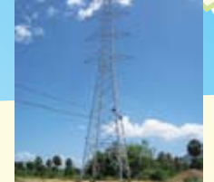
Greater Mekong Power Network Development Project (Cambodia Growth Corridor) (YL: ¥2,632mil. '07)