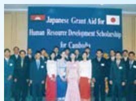
Human Resource Development Scholarship (GA: ¥3,468mil. '00-)