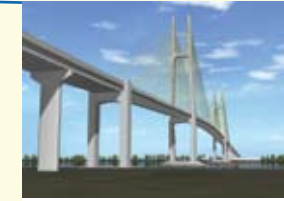
The Project for Construction of Neak Loeng Bridge (GA: ¥11,940mil. '10)