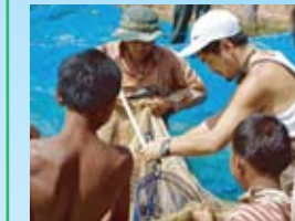
Freshwater Aquaculture Improvement and Extension Project (II) (TC: '11-)