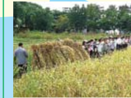
Agricultural Productivity Promotion Project in West Tonle Sap (TC: '10-)