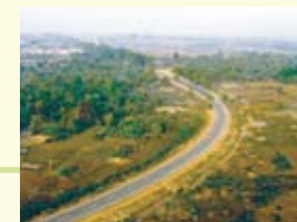
The Project for Improvement of National Road No.6 (Siem Reap Section) (GA: ¥1,307mil. '00)