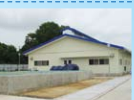
The Project for Construction of Marine Aquaculture Development Center (GA: ¥931mil. '09)