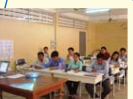
The Project for Urgent Rehabilitation and Improvement of Civil Aviation Meteorology (TC: '06-'08)