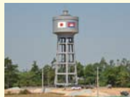
The Project for Improvement of Water Supply System in Siem Reap Town (GA: ¥1,537mil. '04)