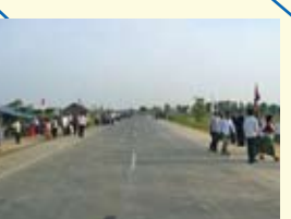
Improvement of the National Road No.2 (Takeo Section) (CPF: '06)