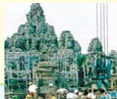
Assistance for Conservation and restoration of Angkor Monuments (CPF: '05)