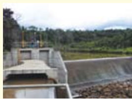
The Project for Rural Electrification on Micro-Hydropower in Mondul Kiri (GA: ¥1,066mil. '06) The Project of Operation and Maintenance of the Rural Electrification on Micro-Hydropower in Mondul Kiri Province (TC: '08-'11)