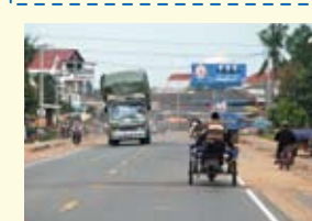
The Project for Improvement of the National Road No.1 (I-III) (GA: ¥7,537mil. '05, '06, '09)