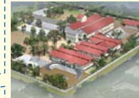
The Project for Improvement of Kampong Cham Hospital in Kampong Cham Province (GA: ¥1,039mil. '08)