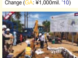
The Project for Replacement and Expansion of Water Distribution Systems in Provincial Capitals (GA: ¥2,760mil. '11)