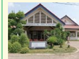
The Project for Improvement of Mongkol Borey Hospital in Banteay Meanchey Province (GA: ¥683mil. '05)