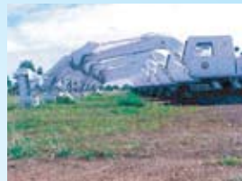
The Project for improvement of Equipment for Demining Activities (I-VI) (GA: ¥5,205mil. '99, '00, '02, '04, '09, '11) Strengthening CMAC's Function for Human Security Realization (TC: '08-'10)