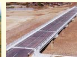
The Project for Improvement of Bridges on National Road No.6A (GA: ¥1,359mil. '00) The Project for Rehabilitation of National Road No.6A (GA: ¥3,012mil. '93)