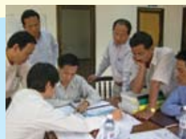
Capacity Building for Water Supply System in Cambodia (II) (TC: '07-'12)